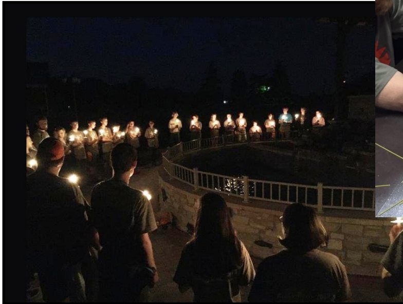
Pictured: Ros-A-Ree participants of years past