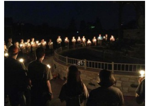
A living rosary is a tradition of the retreat.

for your faith and using the special gifts you have in the service of Christ. We will be exploring prayer, service, and scripture through speakers, games, small group discussions, and service. Back by popular demand, there will also be a themed "escape room." Prayer and reflection times will be plentiful too, with a Living Rosary, Sunday morning mass and Eucharistic Adoration.