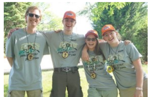
There's fun for all at the Ros-a-Ree!

The earlier you sign up, the more you save! Cost for the retreat is $35 before July 11! All information and online registration is available on the Ros-a-Ree web page . If you would like to send out a flyer to your troop or friends, access it here .