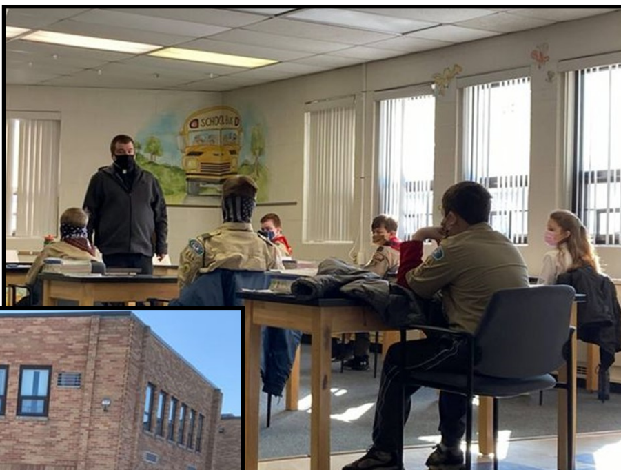
Pictured: Joliet Diocese Catholic Scouts from GSUSA, BSA, and American Heritage Girls enjoying the 2021 Day of Recollection held February 27th at Our Lady of Peace Parish in Darien.